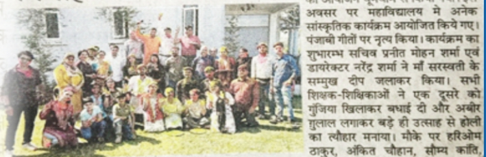
जगमोहन कॉलेज ऑफ लॉ में होली मिलन समारोह में उपस्थित महाविद्यालय के शिक्षक शिक्षिकाएं एवं छात्र-छात्राएं।