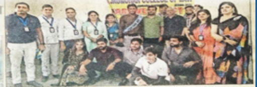
मिस्टर और मिस फैवरवेल को सम्मानित करते अतिथि।